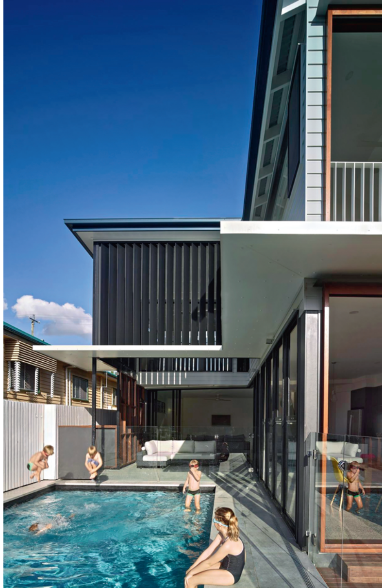
QUICK DIP ... The central pool is a refreshing spot for friends and family.